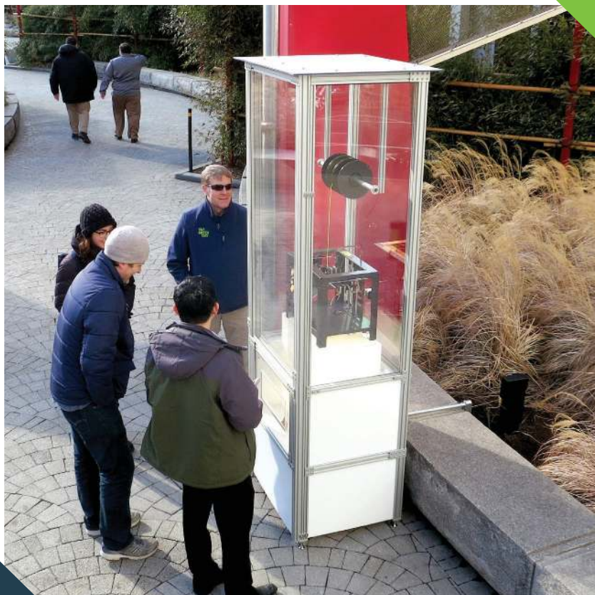
Make and Take