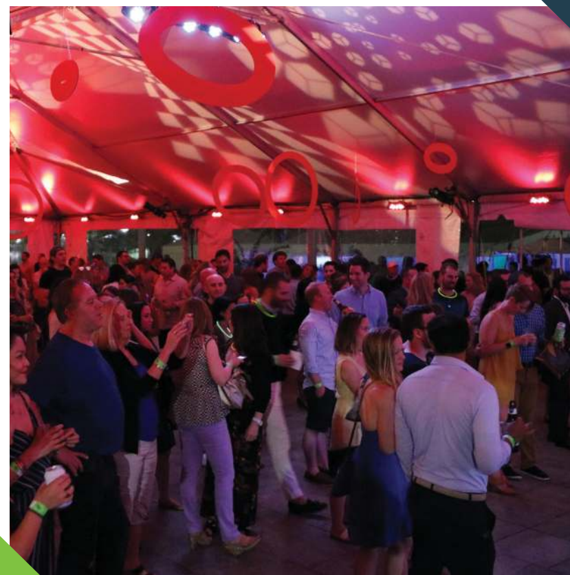
Glow in the Park