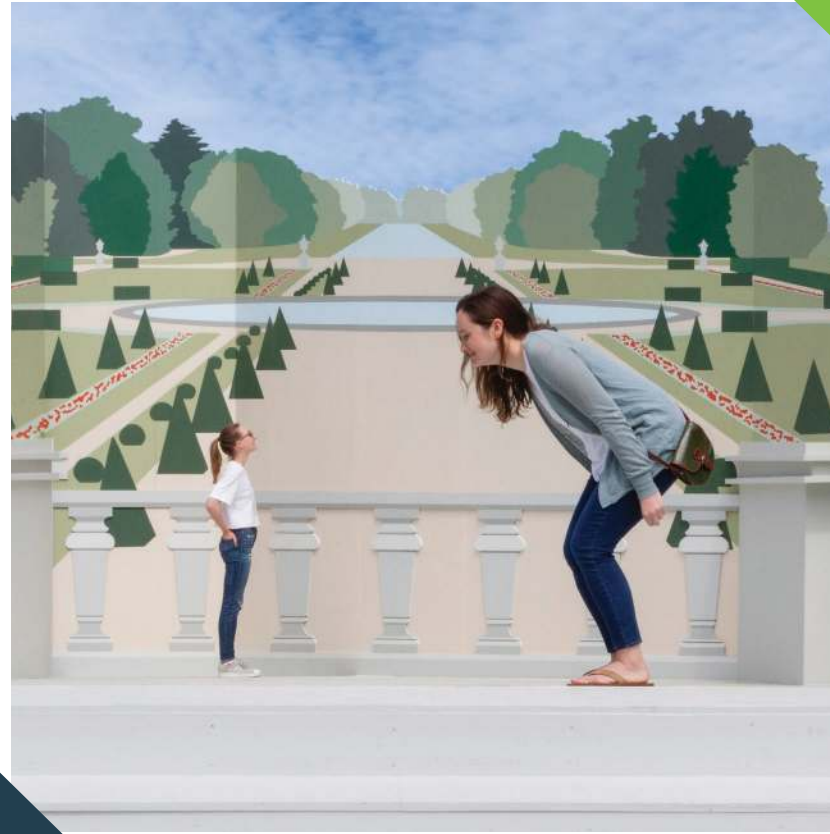
Far from this setting in which I now find myself