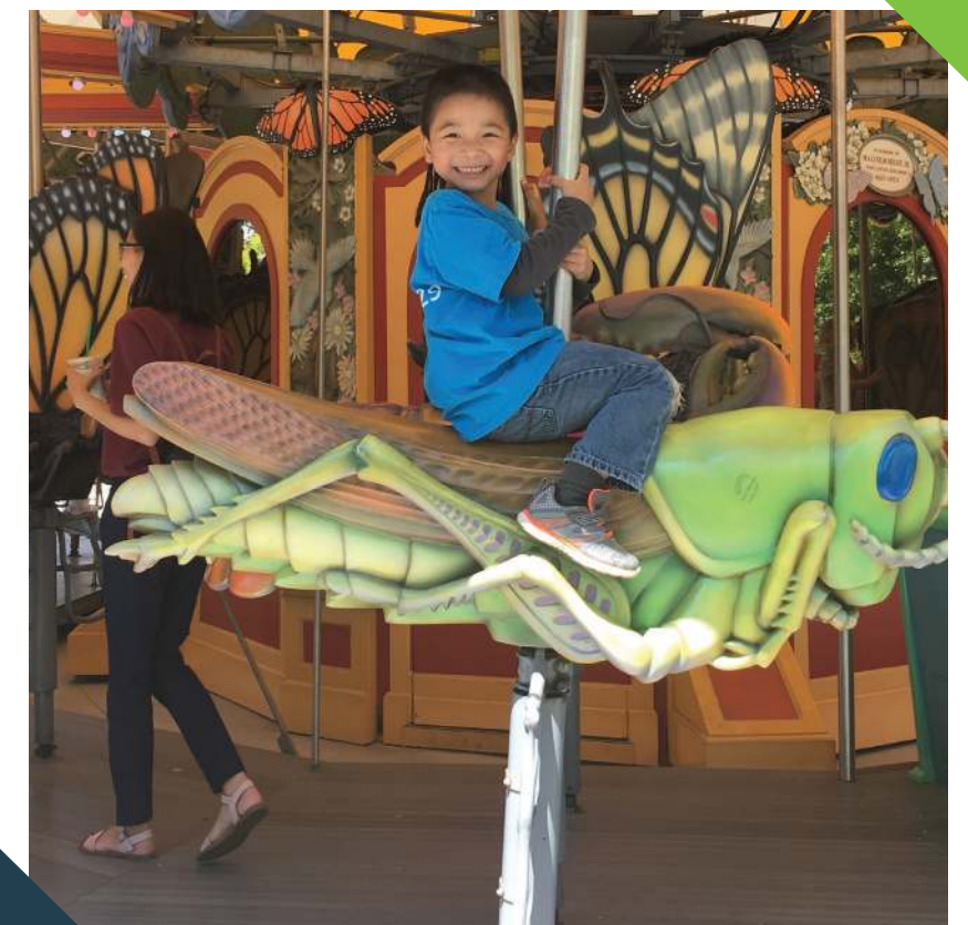
Youth Adventure Day