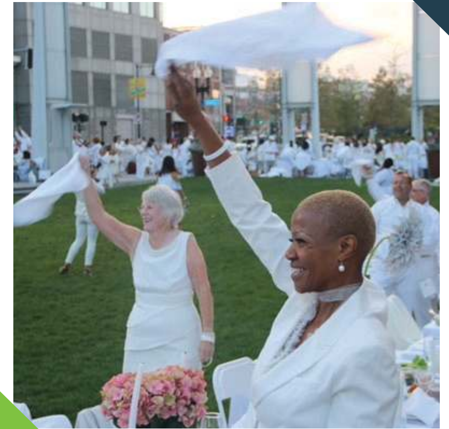
Diner en Blanc