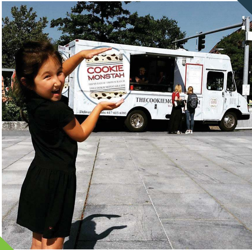
Mobile Eats Program Vendor, Cookie Monstah