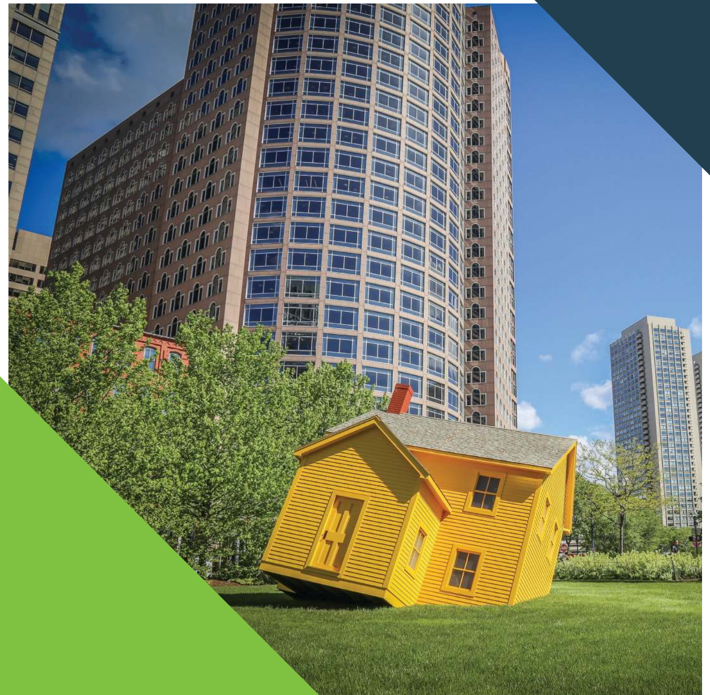
The Meeting House