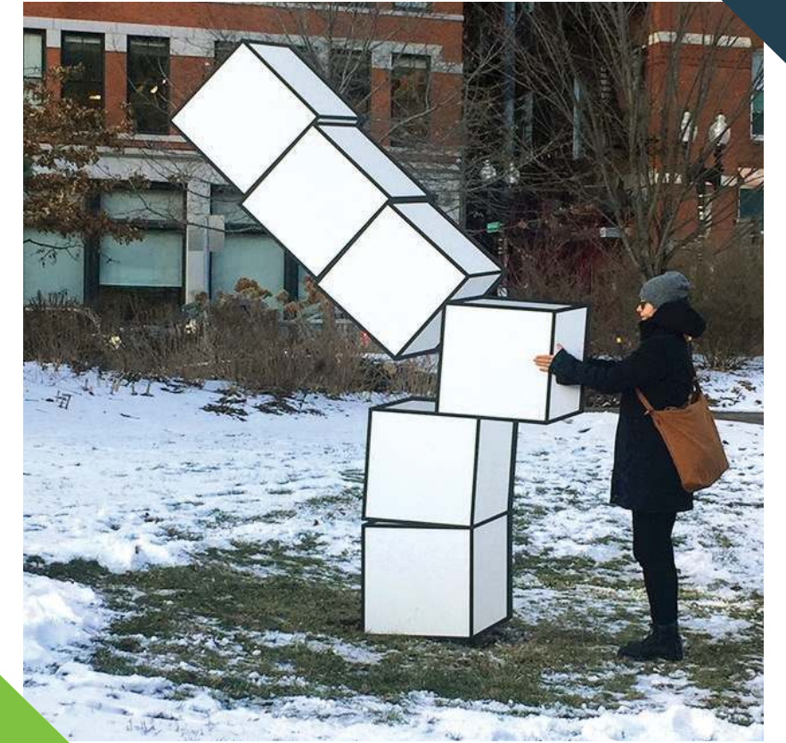
Balancing Act I