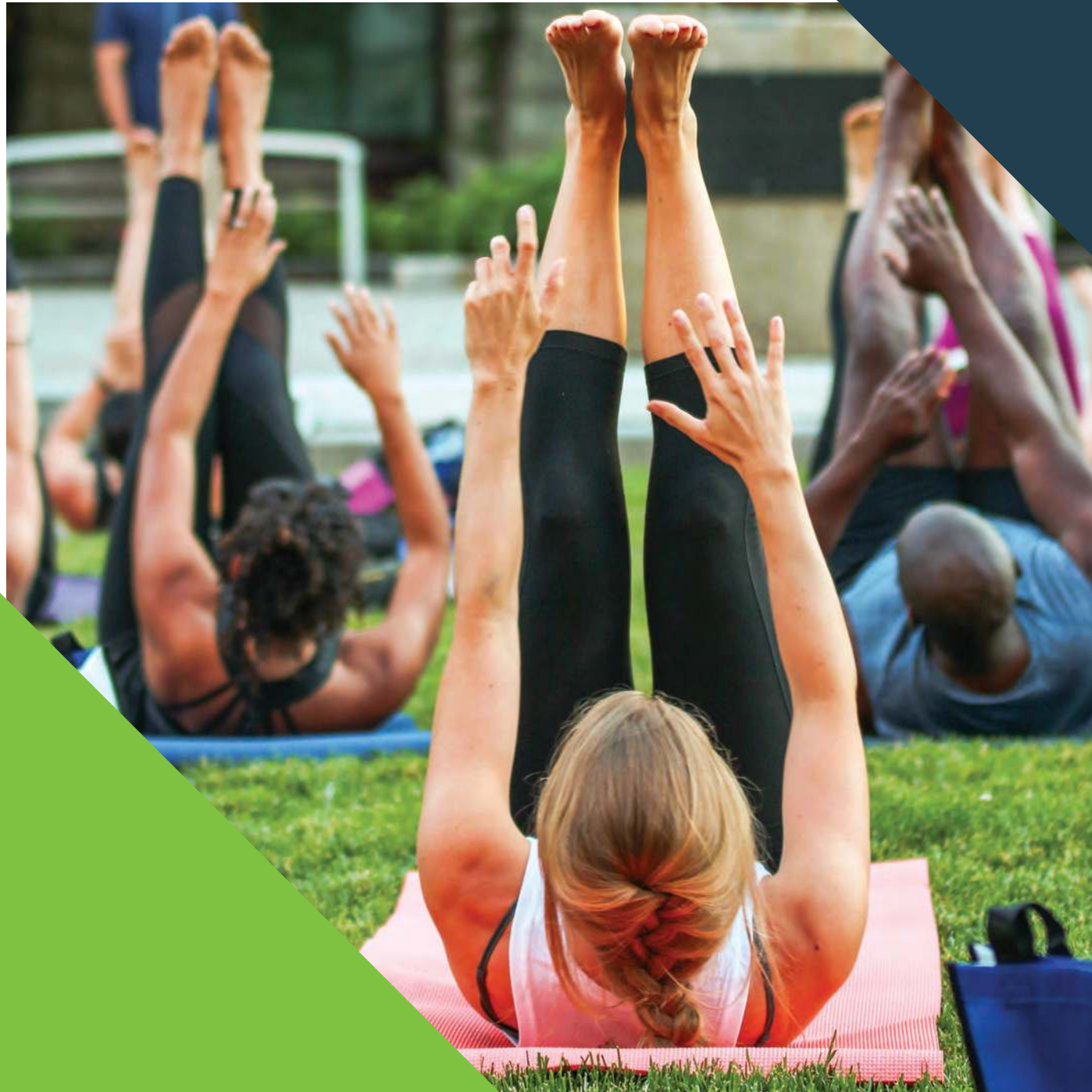
Yoga Around Town