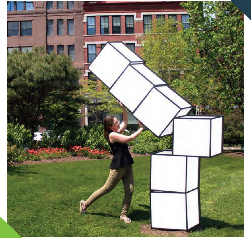
Balancing Act I