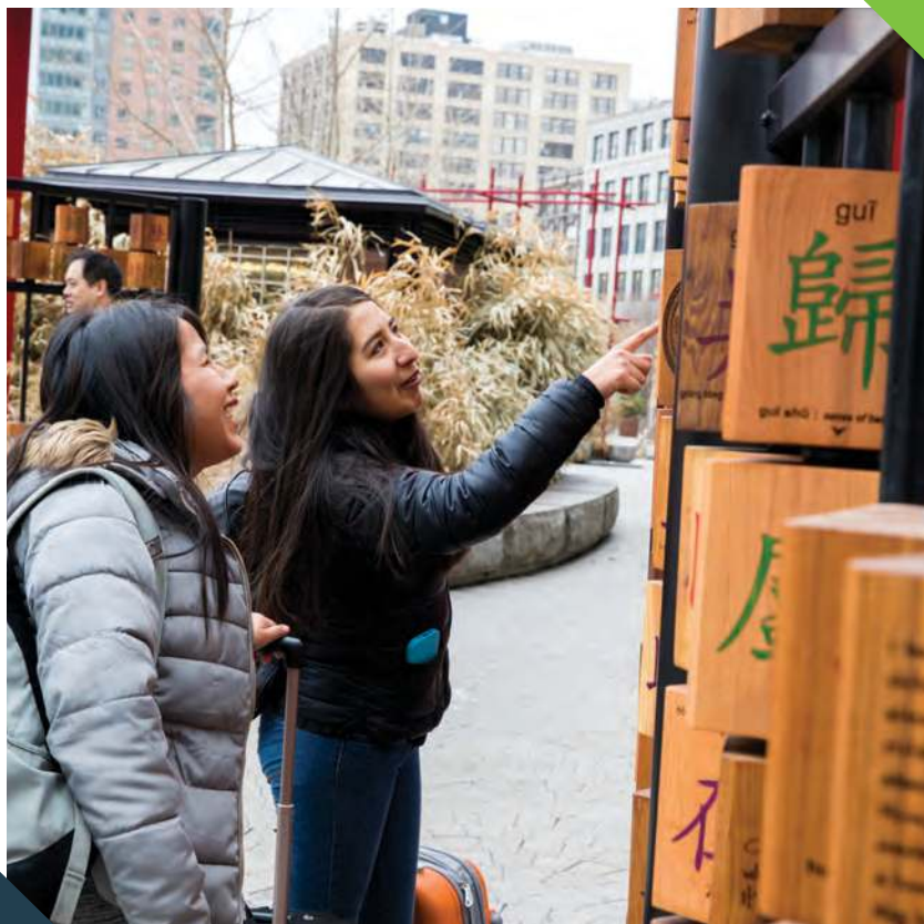
Year of the Dog