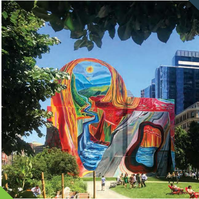
Carving Out Fresh Options