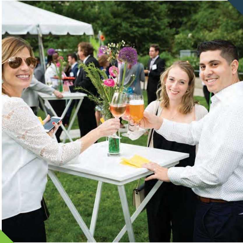
2018 Greenway Gala