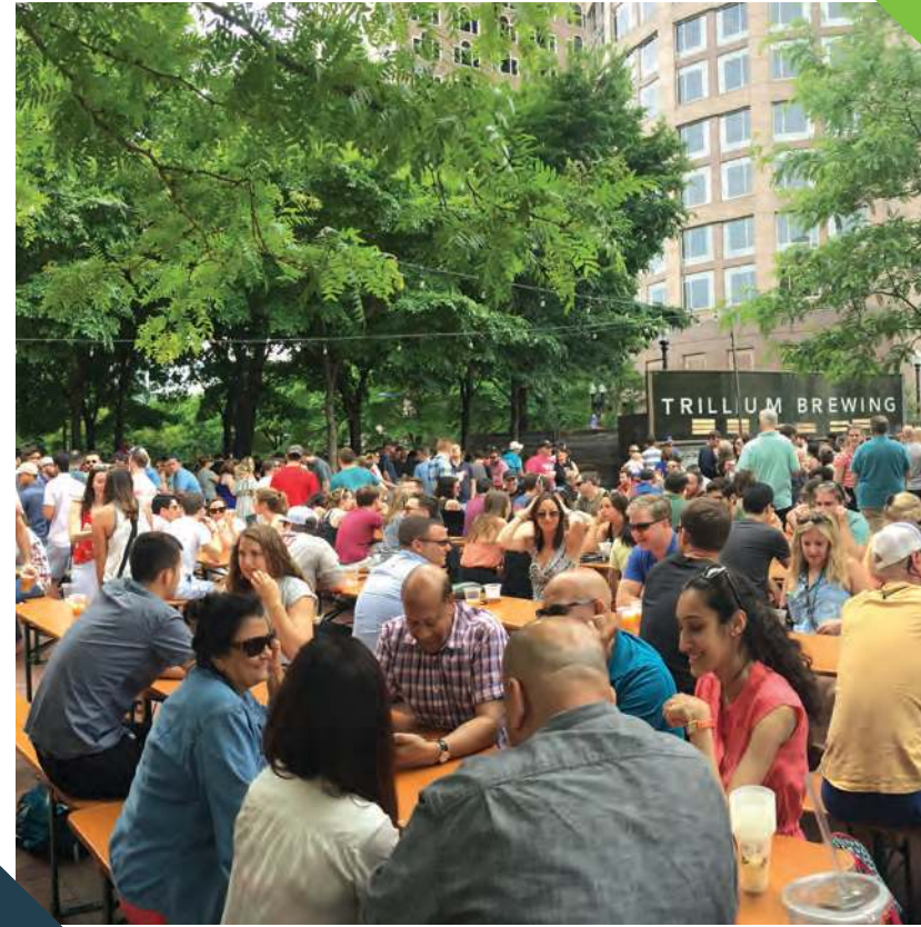
Trillium Garden on The Greenway