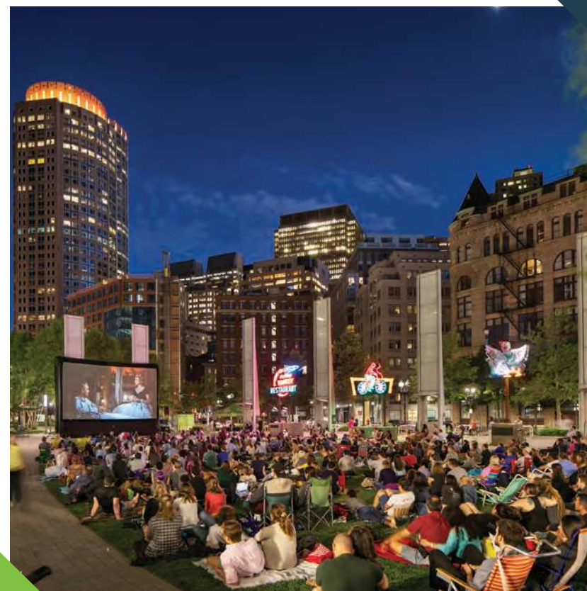
Coolidge on The Greenway