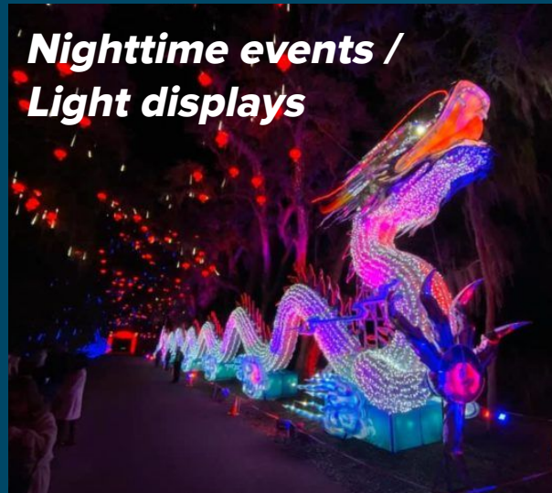
Nighttime events / Light displays