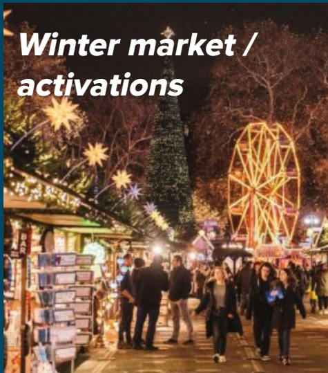
Winter market / activations