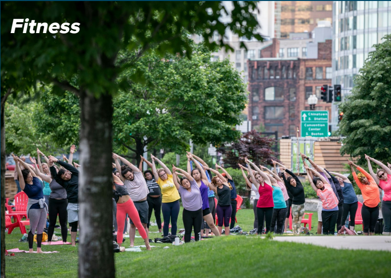
Glow in the Park