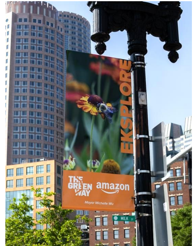
Banner design shown here is from 2025

The deadline to be included on banners is March 6, 2026.