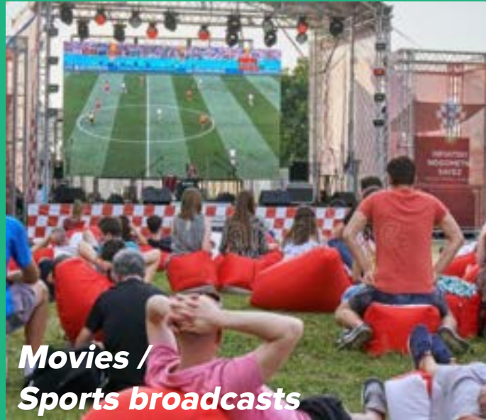
Movies / Sports broadcasts