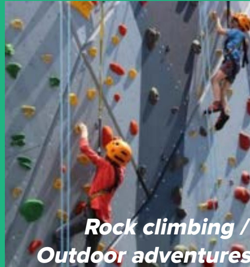
Rock climbing / Outdoor adventures