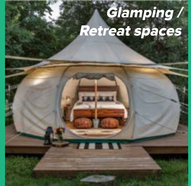
Glamping / Retreat spaces