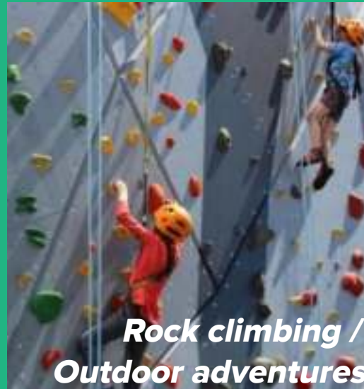
Rock climbing / Outdoor adventures