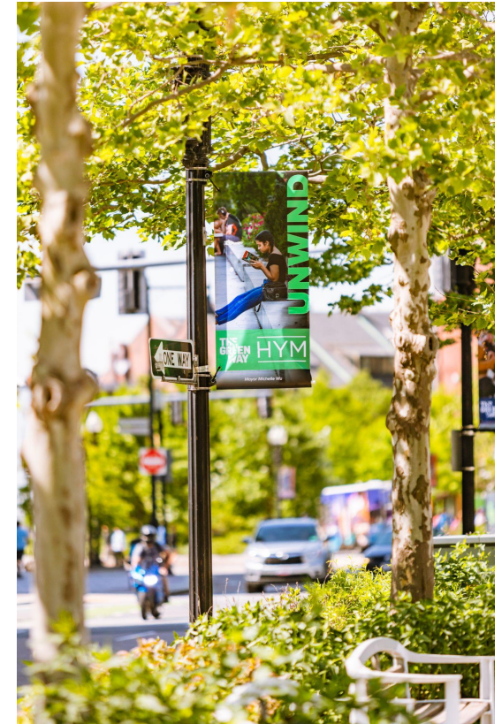
Banner designs shown here are from 2022