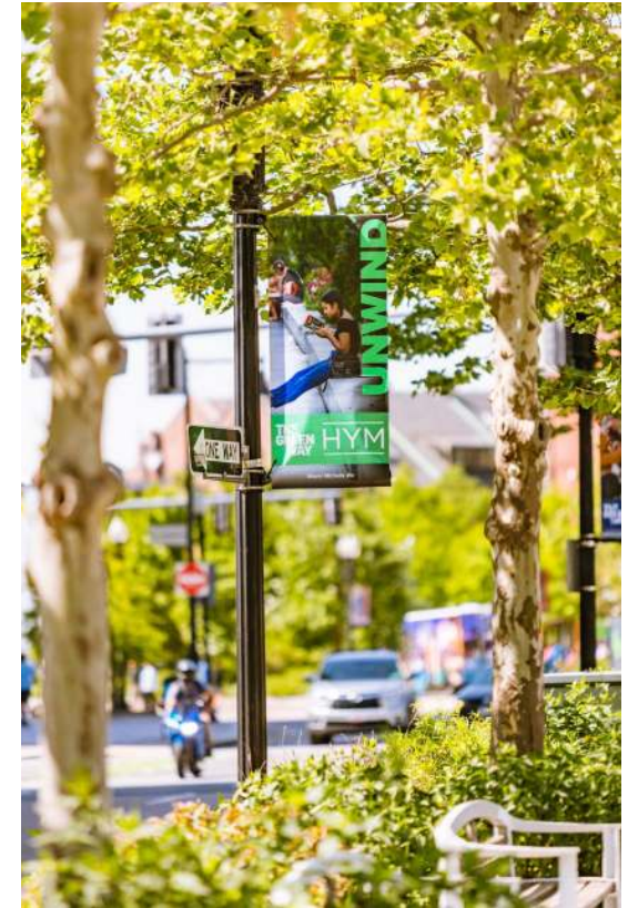
Banner designs shown here are from 2022