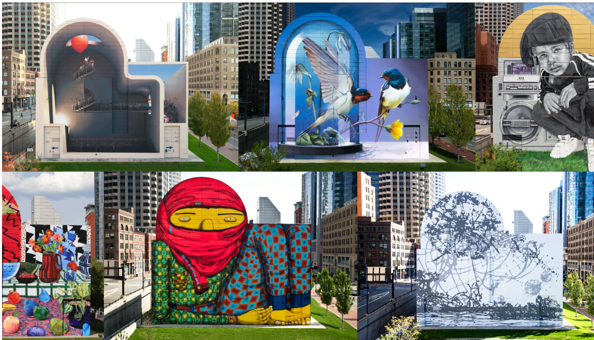
Various Dewey Square Murals, 2012-2024.

Since 2012, the Dewey Square Mural has served as a focal point for bold, contemporary, and thought-provoking public art in downtown Boston. Working with a range of renowned artists, ten murals have been installed to date, each viewed by millions of residents, commuters, and tourists, and each sparking conversation and connection in Boston's shared public space. Six of the murals have been presented in collaboration with curatorial partners, including Boston's Institute of Contemporary Art (2012, 2013), the Museum of Fine Arts Boston (2014), MIT's List Visual Arts Center (2015), the deCordova Sculpture Park and Museum (2017), and Mass MoCA (2024).